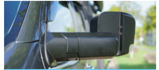
Standard Horizontal Position

Perfect for tray backs and wider service bodies