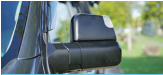
Standard Driving Position

Fit into garages and tight parking spaces