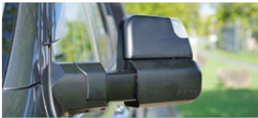
Standard Driving Extended

Perfect for towing camper trailers, horse floats and smaller vans