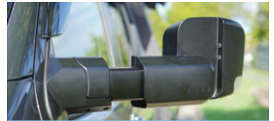
Towing Extended Position

Perfect for towing large vans or wider loads