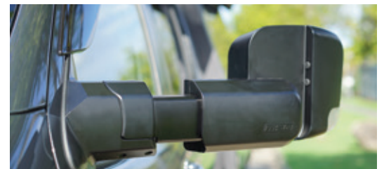
Towing Extended Position

Perfect for towing large vans or wider loads