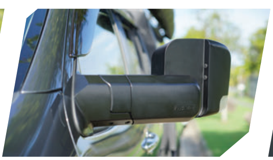
Perfect for tray backs and wider service bodies