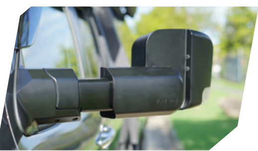
Perfect for towing large vans or wider loads