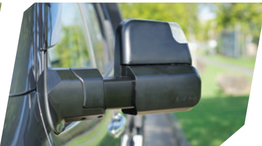
Perfect for towing camper trailers, horse floats and smaller vans