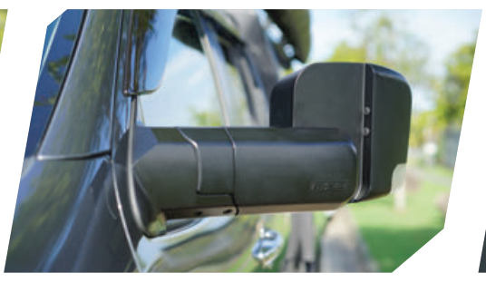
Perfect for tray backs and wider service bodies