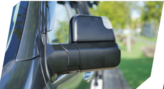
Fit into garages and tight parking spaces