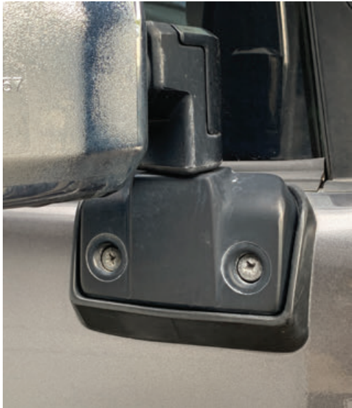
76 & 78 SERIES