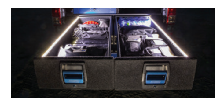
INTERNAL LED STRIP LIGHT delivering increased practicality, complete with manual override switch.

PATENTED "STAY-OPEN BLOCK" allows the drawer to remain in an open position, even on a 30 degree slope!