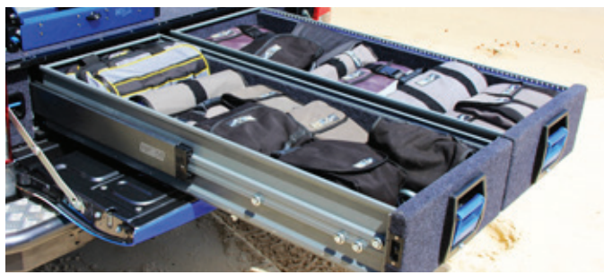
HEAVY DUTY CRASH TESTED 250KG load rating per pair of drawers!