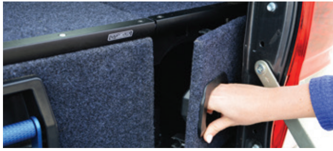
ACCESS UNDER THE DRAWER WINGS now with removable wing face panels!

FLUSH FITTING REMOVABLE WING KITS will be available for most 4WDs and work utes, allowing access to storage areas beside the drawers.