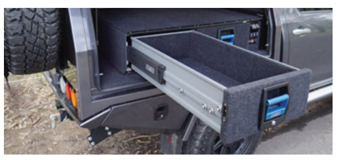
LIGHTER than most generic steel drawers.