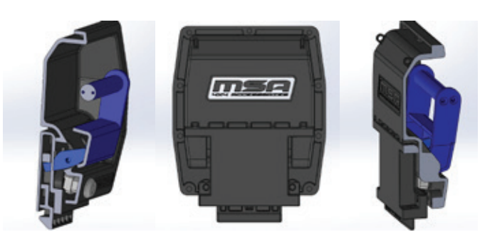
100% SAFE & SECURE lock system cannot be levered open from underneath.

utilises the side of the drawers and the frame as the slide unit. The over extension using custom sealed bearings removes the need for additional slide components, maximising storage space.