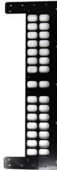
Upper Left Panel