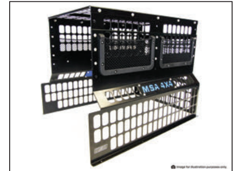
FRIDGE BARRIER MODEL / DROP SLIDE FBDS40N, FBDS50N, FBDS60N, FBDS95N

Depending on your vehicle and particular type of installation it may be necessary to assemble the Fridge Barrier around the Fridge Slide without the Fridge installed as it may not be possible to assemble the barrier completely and lower it over the top of your slide. Do Not Place Fridge Barrier in Curtain Air Bag Deployment Zone