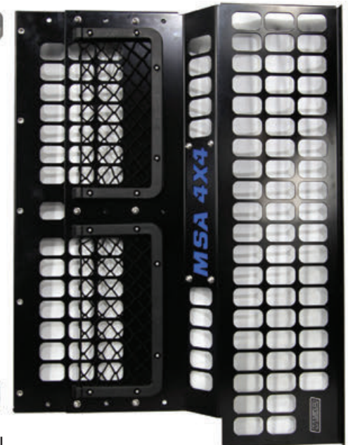
Lower Right Panel