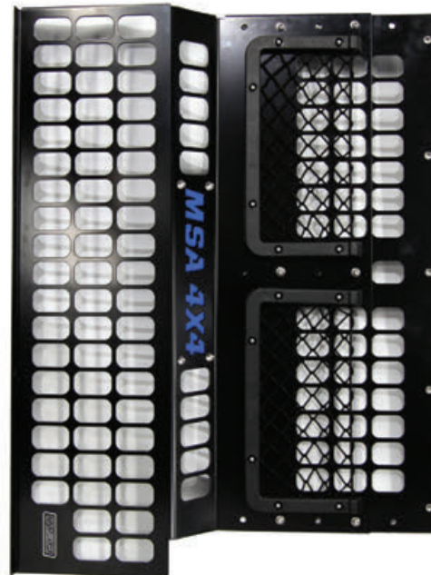
Lower Left Panel