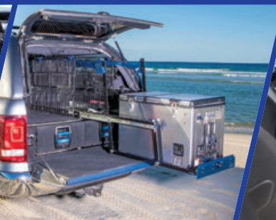
FRIDGE SLIDES & DROP SLIDES