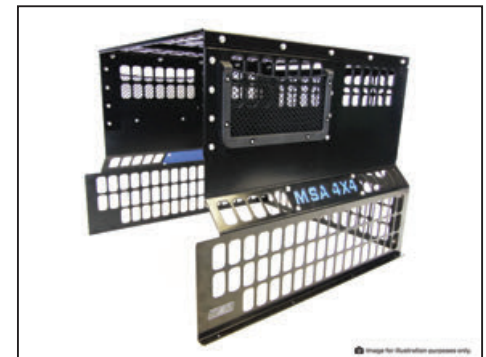
FRIDGE BARRIER MODEL / DROP SLIDE FBDS45N