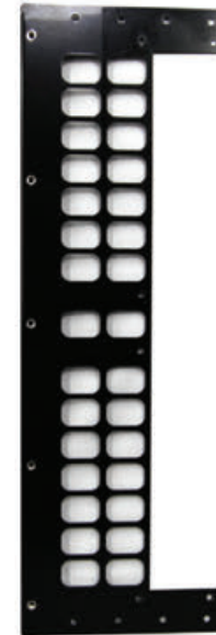
Upper Right Panel