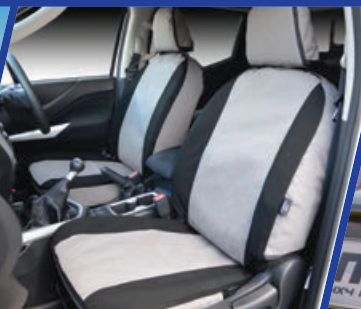
PREMIUM CANVAS SEAT COVERS